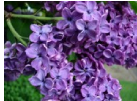
If only I could figure out how to make this scratch and sniff...